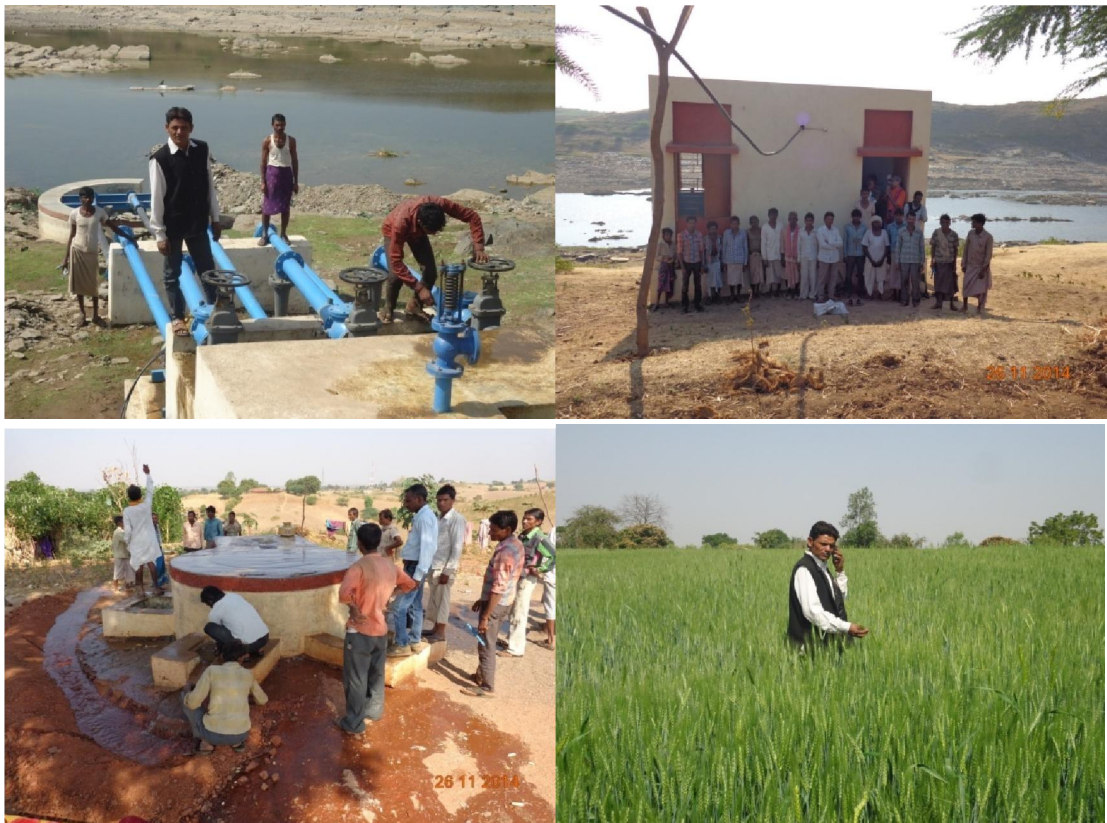
Community lift irrigation scheme at village Ghorwada Tehsil: Sajjangadh District: Banswara implemented by NM Sadguru Water & Development Foundation under Rashtriya Krishi Vikas Yojana, Government of Rajasthan.

Ghorwada Lift Irrigation: This Lift Irrigation scheme is in Ghorwada village of Tandri panchayat of Sajjangarh tehsil in Banswara district. The source of water for this Lift Irrigation is Anas River having sufficient water during irrigation season. Work of this LI scheme is completed in year 2013-14. The height of lifting of water from source to highest point is 55 m and installed pumping capacity is 75H.P. From this scheme 65 families are getting irrigation in 75 acres of land one season. Out of 75 acres of irrigated land, wheat was sown in 55 acres and gram in 10 acres and maize in 10 acre in rabi season of 2015-16. Total production was 580 quintal of wheat, 155 quintal of maize and 55 quintal of gram. Total income of one season is Rs. 12.05 lakhs and average income per acre is Rs. 16000/- . Besides production of food grain, farmers also have sufficient fodder for their cattle from these crops. This is income range in initial years which will increase further with adoption of better practices and support being provided by us.